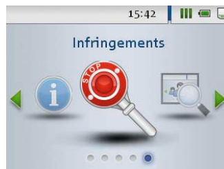
On-site infringement monitoring

Order no. for DLKPro Neoprene Case: A2C59514917