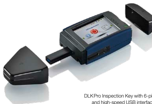
DLKPro Inspection Key with 6-pin and high-speed USB interface